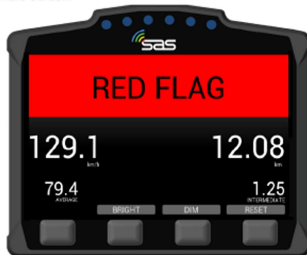
SCREEN 11. RED FLAG in Stage Mode

SCREEN 11 – Once the red flag has been acknowledged, normal stage functions will display with a warning still at the top of the screen.